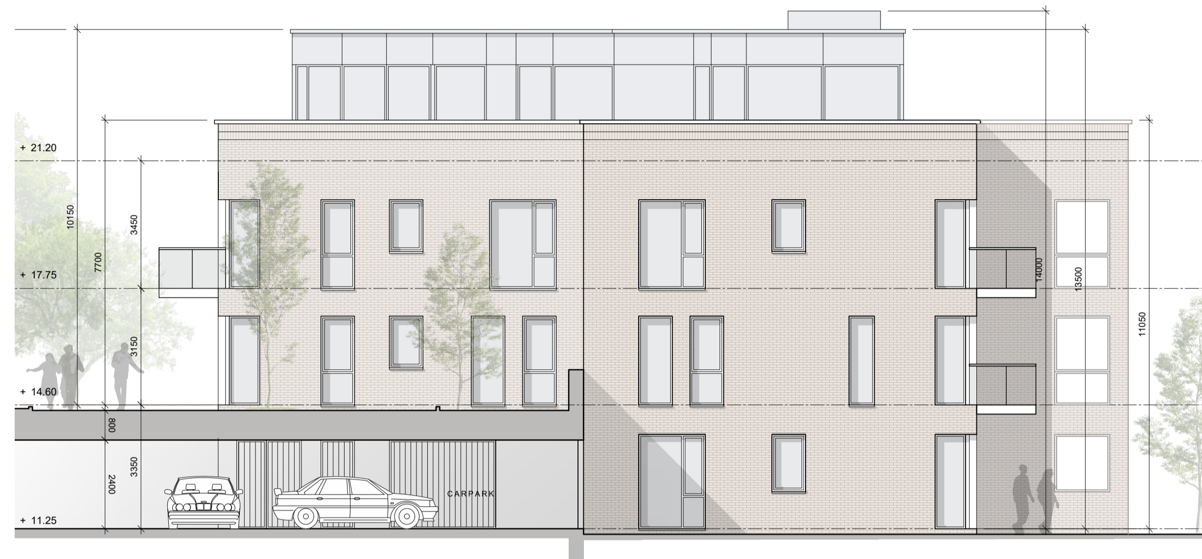
BLOCK 4 NORTH FACING END ELEVATION SCALE: 1:100