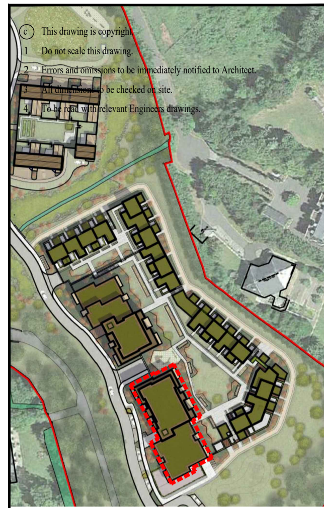
KEY PLAN INDICATING POSITION OF APARTMENT BLOCK 4 NOT TO SCALE