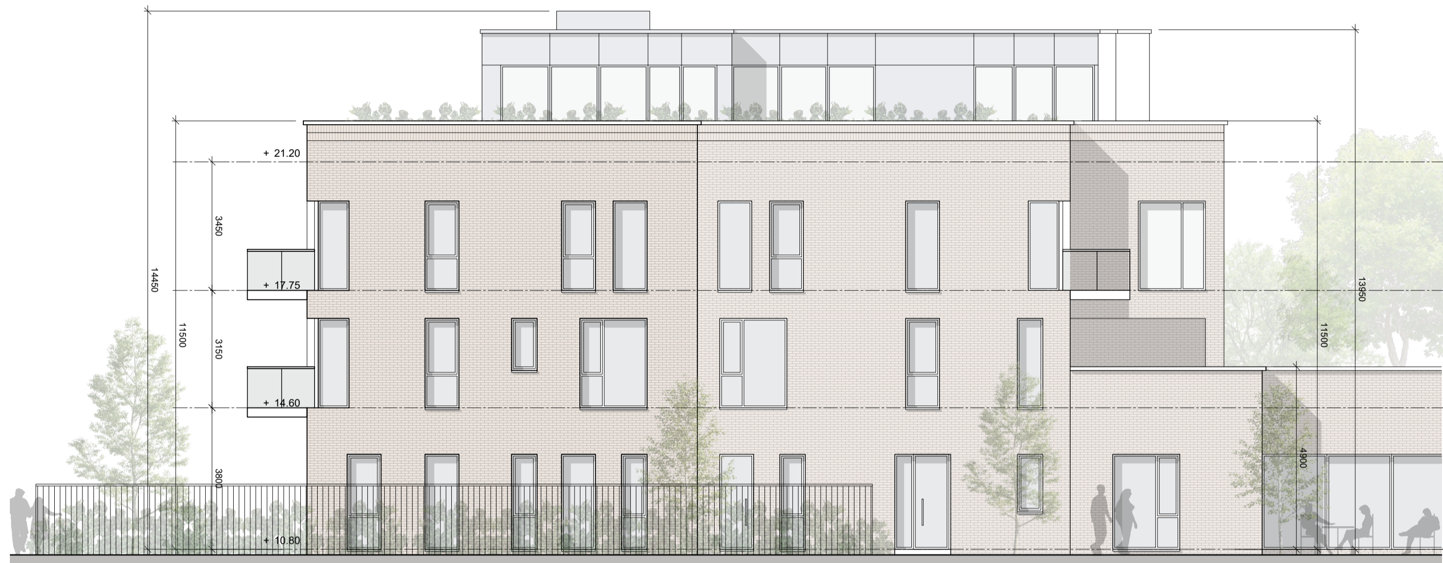
BLOCK 4 SOUTH FACING END ELEVATION SCALE: 1:100